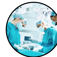
HEALTHCARE LAUNDRY SERVICE