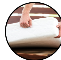
CURTAINS AND MATTRESSES

Finished product, designed to be sprayed or nebulized on any type of fabric. It guarantees protection against the growth of all types of microorganisms up to 7 days.