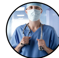
UNIFORMS AND ALL KINDS OF FABRICS