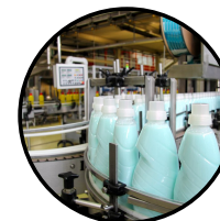
DETERGENT AND MANUFACTURING INDUSTRY

Specially designed to be incorporated in industrial and domestic detergents or liquid softeners, during the manufacturing process.