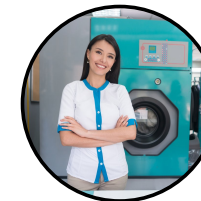
INDUSTRIAL LAUNDRY SERVICE AND DRY CLEANING COMPANY

After the disinfection and cleaning processes of the fabrics they are protected from contamination by microorganisms. However, just a few seconds after the washing cycle, even inside the washing machine, the clothes are exposed to possible contamination.