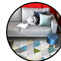
UPHOLSTERY AND CARPETS